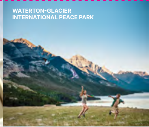
WATERTON-GLACIER INTERNATIONAL PEACE PARK