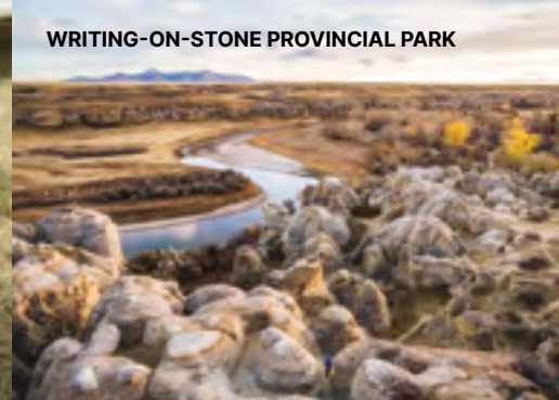
WRITING-ON-STONE PROVINCIAL PARK