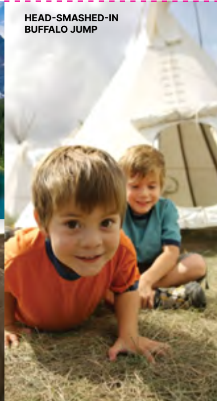
HEAD-SMASHED-IN BUFFALO JUMP