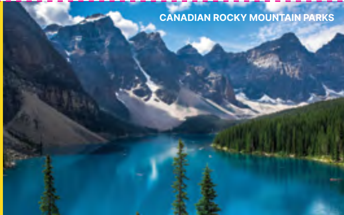
CANADIAN ROCKY MOUNTAIN PARKS

From the Canadian Rocky Mountain Parks of Banff and Jasper to the west, to Waterton-Glacier International Peace Park, Head-Smashed-In Buffalo Jump and Writing-on-Stone Provincial Park to the south, and Dinosaur Provincial Park to the East, the majority of Alberta's UNESCO World Heritage Sites lie close to Calgary.