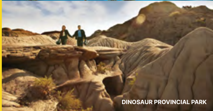
DINOSAUR PROVINCIAL PARK